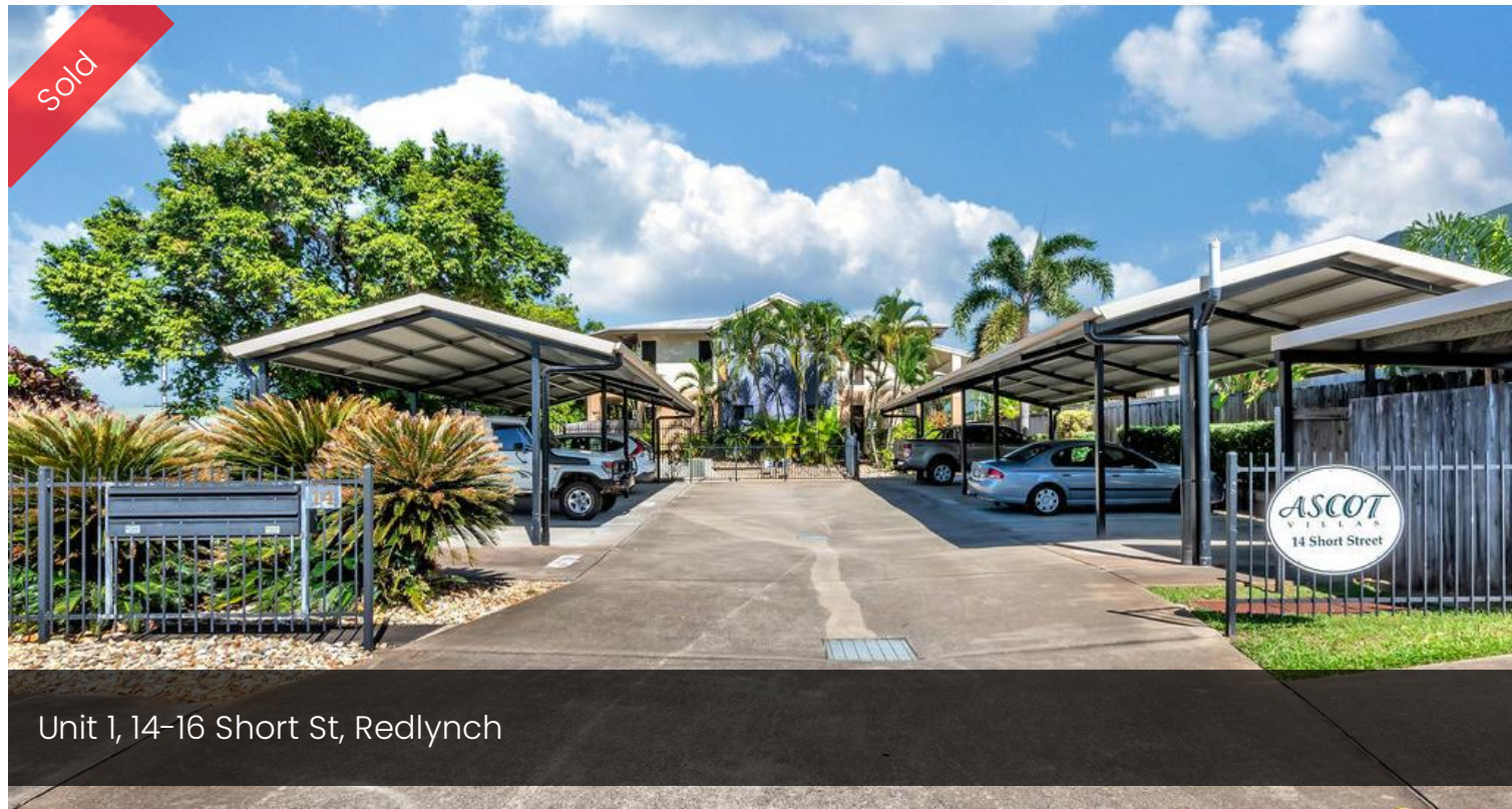
Unit 1, 14-16 Short St, Redlynch